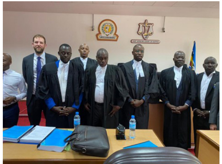
Eacop lawyers entered appearance at the East African Court of Justice and ready to proceed with the court hearing