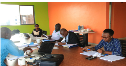
On the 4th day of October, we had further discussions on the merits of our case.