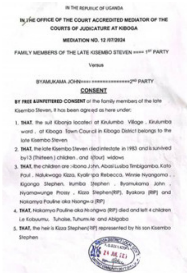
Some of the successful outcomes of the CAG’s representation of parties at the district from the office of the court accredited mediator at Kiboga.