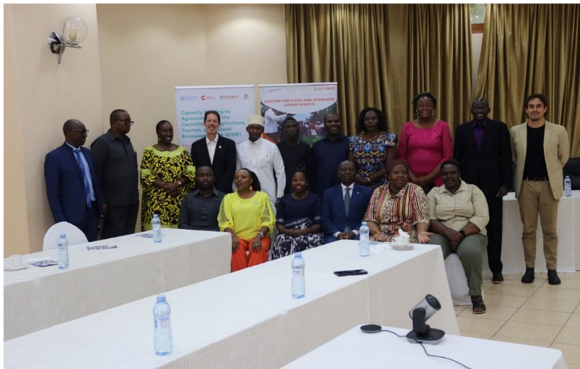
The members pose for a group after signing the resolution and giving of the closing remarks.

T he Committee on Agriculture, Tourism, and Natural Resources (ATNR) of the East African Legislative Assembly (EALA) and the Food and Agriculture Organization (FAO) in partnership with the Centre for Food and Adequate Living Rights (CEFROHT) signed a resolution officially recognizing agroecology as a strategic priority for formulating and recommending sustainable policies in agriculture, tourism, and natural resource management across the East African region.