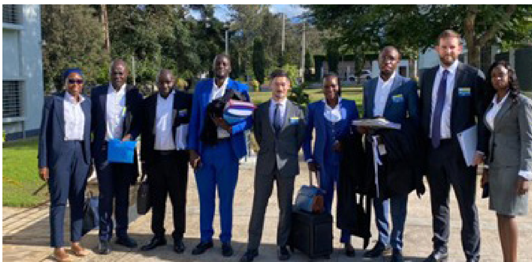
The EACOP legal team after finalizing the discussions for the case in Arusha.