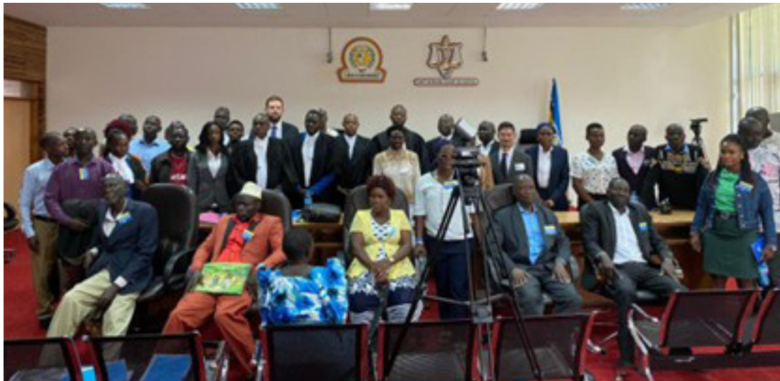
The EACOP legal team and the PAPs while in Court