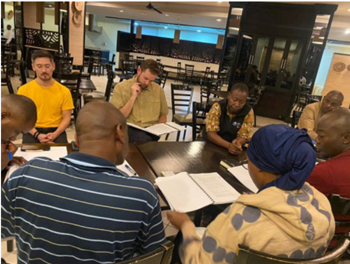
The EACOP Lawyers while in Arusha having final preparations ahead of the court hearing of the appeal case