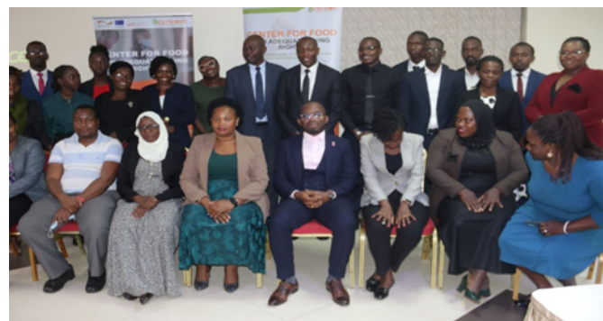
CEFROHT conducting capacity building of magistrates and other court officials