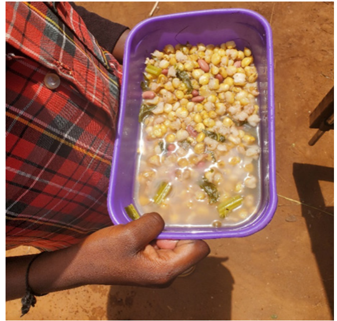
Pictures of some of the school children at St. Josephs about to have lunch of a mixture of maize and beans commonly referred by them as "empengere"

In Uganda, while up to eight million children attend school, only 33% receive meals, leaving the majority hungry. This hunger affects cognitive development, academic performance, and overall achievement, as highlighted in reports by the National Planning Authority (2017) and the Uganda Bureau of Statistics (2014). Particularly concerning is the fact that 66% of primary learners do not have access to meals at school.