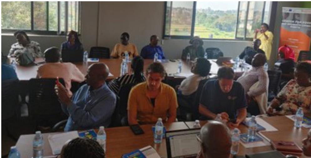
EALA -ATNR committee members, FAO representatives, Board Members and other members from the Collaborative at CEFROHT offices.

The dialogue concluded with a shared commitment to promoting agroecology within the East African Community. The EALA-ATNR committee members expressed their support for agroecological initiatives and pledged to advocate for policies that prioritize sustainable and equitable food system.