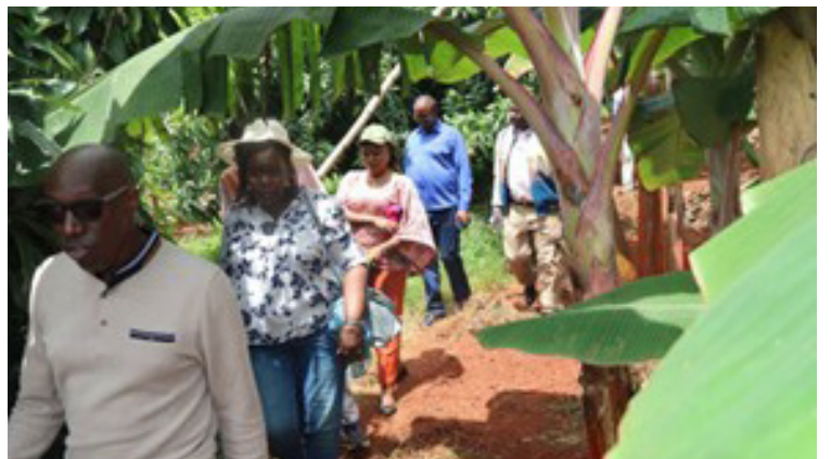
EALA-ATNR committee members, FAO officials and the CEFROHT officials posed for a group photo during the site visit at CEFROHT's model farm.

By engaging in these activities, the participants gained a deeper understanding of the potential of agroecology to address food security, climate change, and rural development challenges in the East African region at the community level. Show casing the positive impacts of Agroecology, that inspired the parliamentarians to champion Agroecological policies and allocate resources to support its implementation in the partner states.