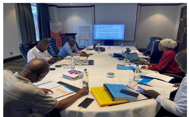
On 22nd October, the lawyers having a discussion on how to strength the appeal case that is before the EACJ.