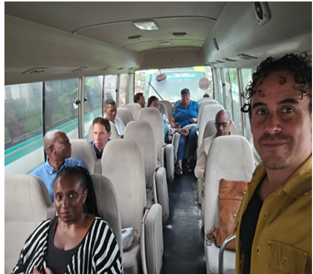
Photo on both on the left and Right showing the officials from FAO and the EALA-ATNR committee members on transit, while going to the field at CEFROHT's model farm for a site visit in Mukono District-Uganda.