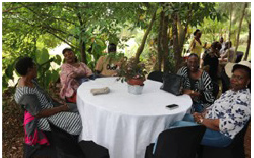
EALA-ATNR committee members and officials from FAO arrive at the CEFROHT's Agroecology learning center for the site visit in Mukono.