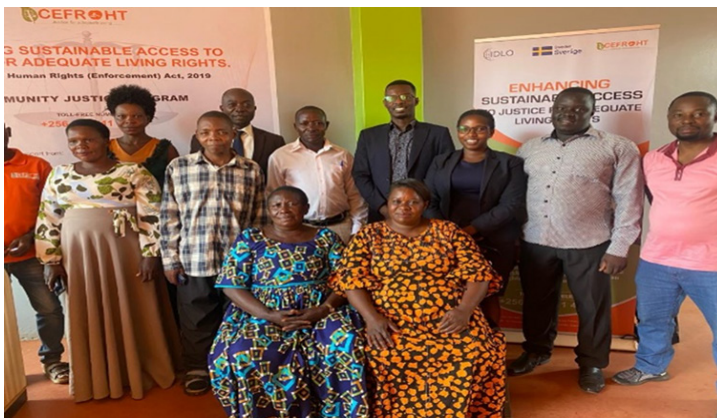
A team of CEFROHT staff and beneficiaries at our field office in Kiboga.

We are thrilled to highlight that in this year we have been able to handle and complete in the shortest period of time, over 80 cases both in court and through mediation in Kyankwanzi, Kiboga and Buyende Districts.