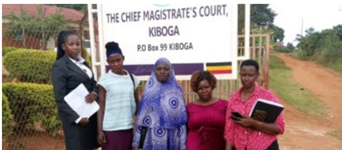
CEFROHT’s lawyer with the beneficiaries after court victory