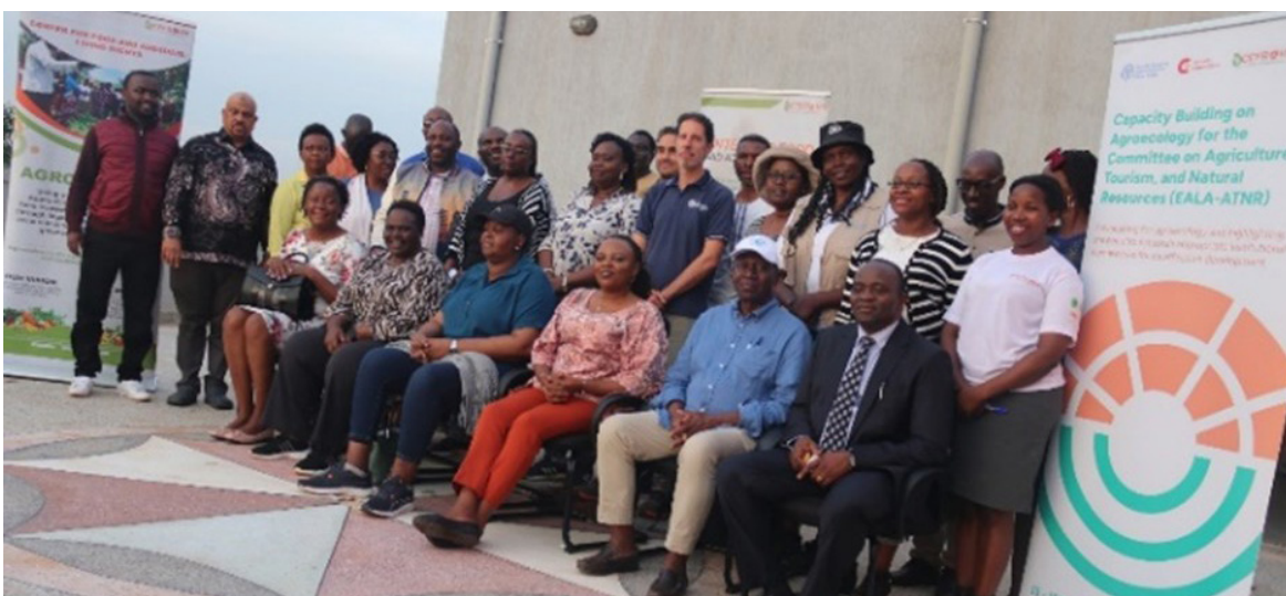
The EALA-ATNR committee, FAO officials, CEFROHT board members and staff, members from other Civil Society Organizations hosted at CEFROHT offices for a dialogue on promoting Agroecology in East Africa using the legal and policy frameworks.