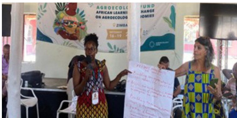
The E.D CEFROHT and the CEFROHT legal officer launching the Agroecology Legal Network for Africa at the Tripartite event in Harare, Zimbabwe.