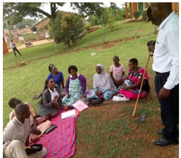
CEFROHT Legal Officer with our CAG at Kiboga Chief Magistrate Court mediating parties after Court giving parties time to agree outside court.