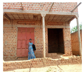
Proscovia showing CEFROHT lawyer the land and the two rooms she obtained after the intervention of CEFROHT